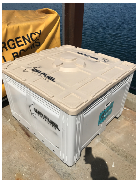
Spill Kits will be marked and may be larger or smaller boxes/bins